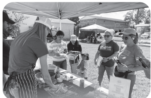
Farmer's Market Cooking Demo

Thanks to the support of CommunityWorks and the Battle Creek Foundation, the RPNA has been actively working with residents and businesses on neighborhood improvement projects. If YOU want to get more involved in projects that improve the neighborhood, contact us at 616-243-2489 or info@rooseveltparkna.org. From trash clean ups to helping with community events, there's lots of ways to show off your talents and get involved! In the words of Mother Teresa, "Together we can do great things."