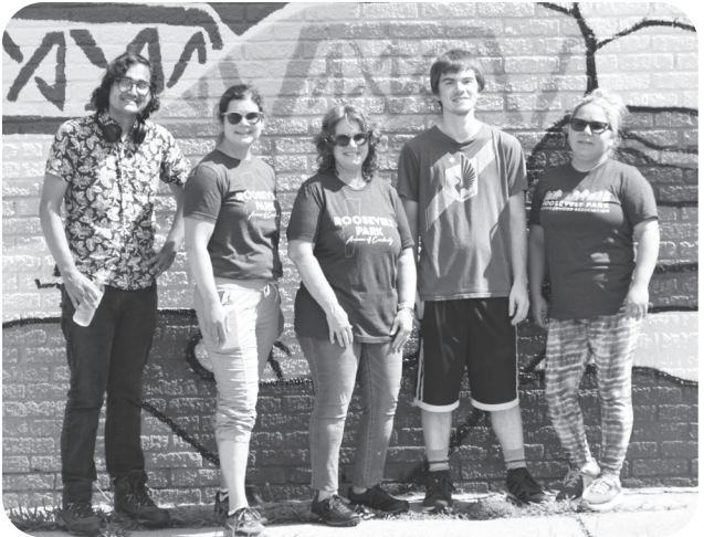
Caulfield Alley Trash Clean Up

Thanks to the support of CommunityWorks and the Battle Creek Foundation, the RPNA has been actively working with residents and businesses on neighborhood improvement projects. If YOU want to get more involved in projects that improve the neighborhood, contact us at 616-243-2489 or info@rooseveltparkna.org. From trash clean ups to helping with community events, there's lots of ways to show off your talents and get involved! In the words of Mother Teresa, "Together we can do great things."